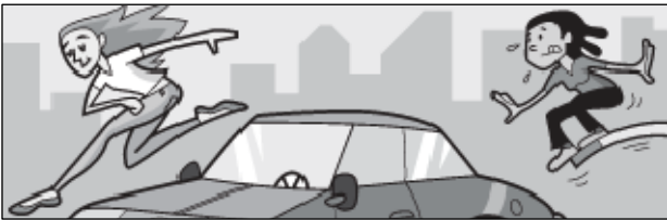
Ellie and Mary _____

2 Ask Student B questions about what the other members of the Daredevil family were doing. Complete the sentences.