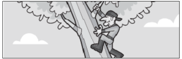
Grandad Daredevil _____