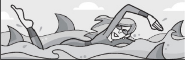
Mrs Daredevil _____

1 The Daredevil family were busy at eight o'clock yesterday evening. Look at the pictures and write what each person was doing. Use the past continuous.