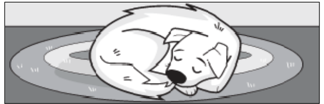
The dog _____