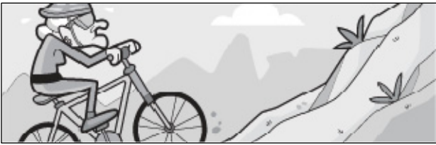
Grandma Daredevil _____